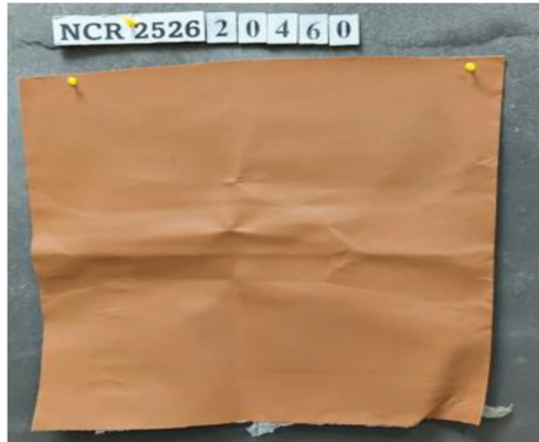
Figure 3: Shows the cactus leather, which was used to obtain our data.

mm \pm 10% thick. It has a Cabreta texture, a Mocha Mousse color, and costs 27 US$ per linear meter, which is 1 m \times 1.4 m. Across Desserto's 14-acre cactus plantation, the cacti absorb 8,100 tons of CO 2 per year, while emitting only 15.3 tons. 29 To ensure minimal impact on the environment, Desserto harvests a select few mature leaves every 6–8 months, facilitates a solarium drying process without using additional energy, and then uses its patented process to create cactus leather. 29 Unlike other plant-based leathers, Desserto is PVC-free and contains roughly 28% biopolyurethane, which has a lower environmental effect than other synthetic leathers. 30 This ensures that cactus leather is a sustainable material.